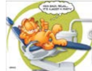
SPRPC-2321 Kick Back Relax