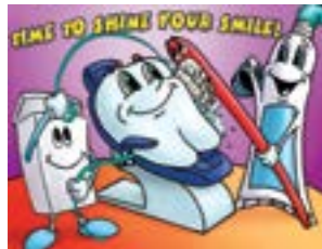
SPRPC-7681 Time To Shine