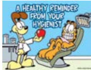
SPRPC-00338 Healthy Reminder