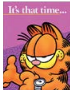
SPR82-027 It's That Time