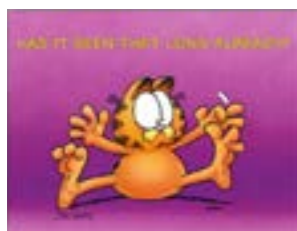
SPR82-137 Has It Been That Long?