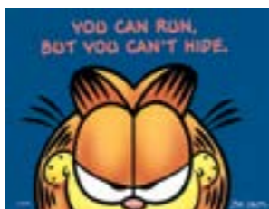
SPR82-153 You Can Run