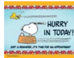
SPRPC-03137 Pea On The Fly