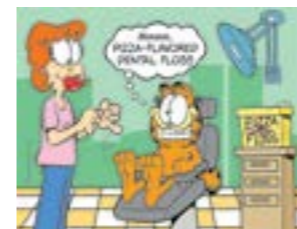
SPRPC-03161 Pizza Floss