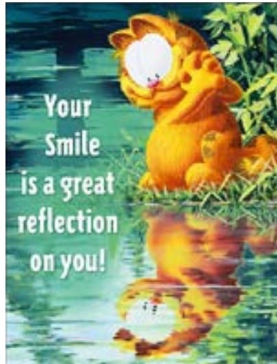
SPRPC-3451 Smile A Great Reflection