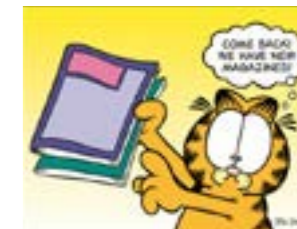
SPR82-727 Come Back We Have