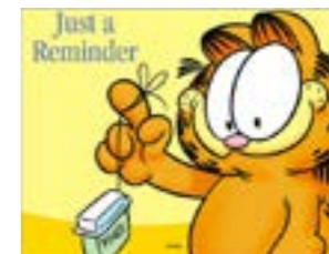
SPR82-194 Just A Reminder