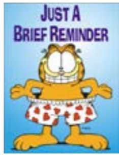
SPR82-671 Brief Reminder