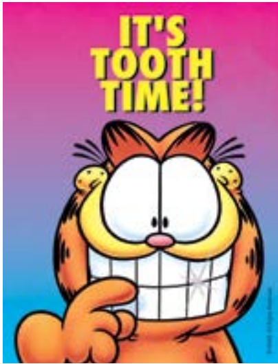
SPR82-752 It's Tooth Time