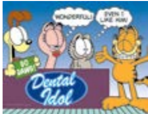
SPRPC-7634 Dental Idol