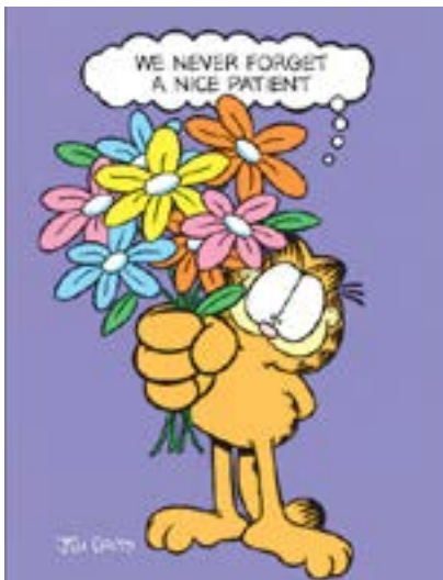
SPR82-728 A Nice Patient