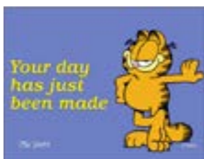
SPR82-036 Day Has Just Been Made