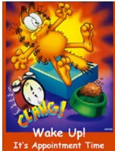
SPRPC-3250 It's Appointment Time