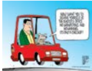
157515T It's Only A Checkup