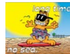
SPR82-001 Long Time No Sea