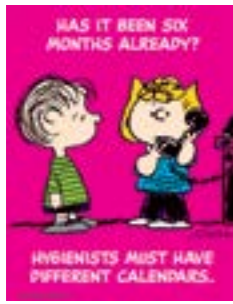
SPRPC-6106 Hygienist Calendars