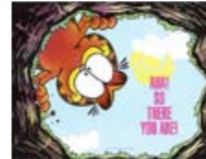
SPR82-158 So There You Are