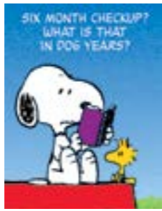
SPRPC-6127 Dog Years