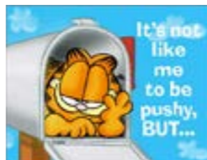
SPR82-026 It's Not Like Me