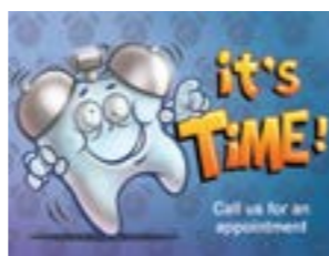
SPRPC-03032 Alarm Tooth