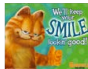
SPRPC-4881 We'll Keep Your Smile