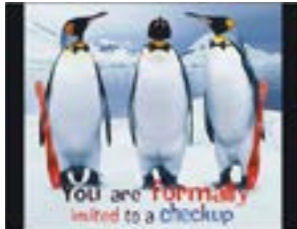
SPRPC-5158 Formal Invite