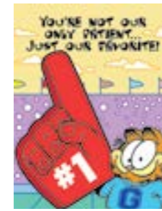
SPRPC-03159 Favourite Patient