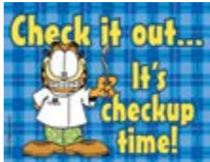
SPRPC-5898 Check it Out