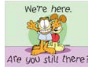
SPRPC-0376 We're Here