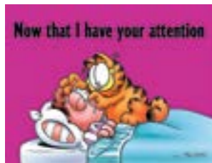
SPR82-759 Have Your Attention