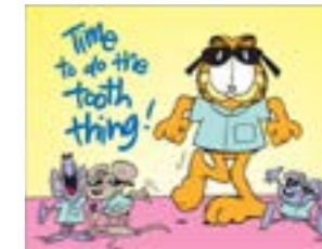
SPRPC-0750 Do The Tooth Thing