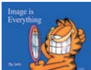
SPR82-195 Image Is Everything