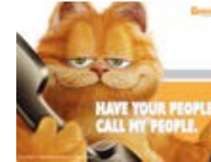
SPRPC-4462 Call My People