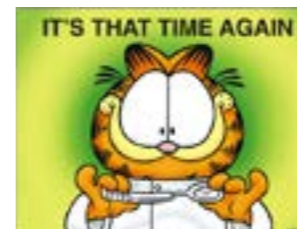
SPR82-197 It's That Time Again