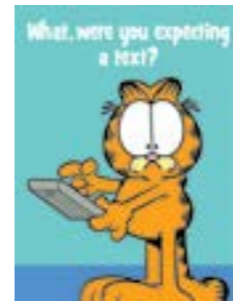
SPRPC-03162 Expecting A Text