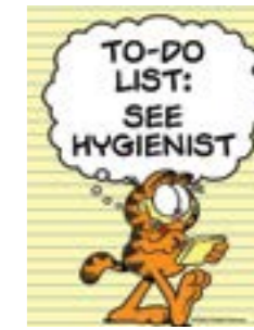
PC-4889 Got To Do List