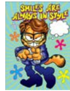
SPRPC-1989 Always In Style