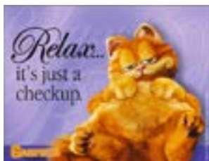
SPRPC-4879 Relax It's Just A Checkup