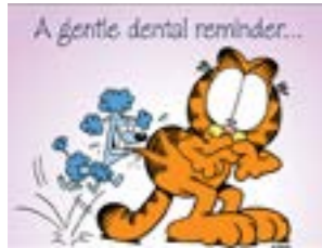
SPRPC-3441 A Gentle Dental Reminder