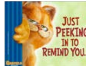
SPRPC-4878 Just Peeking In