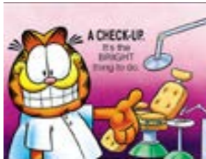
SPR82-755 The Bright Thing