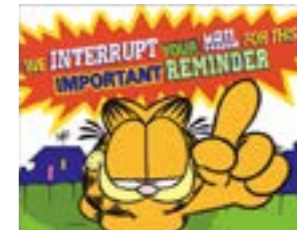
SPR82-592 Interrupt Your Mail