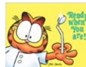
SPR82-154 Ready When You Are